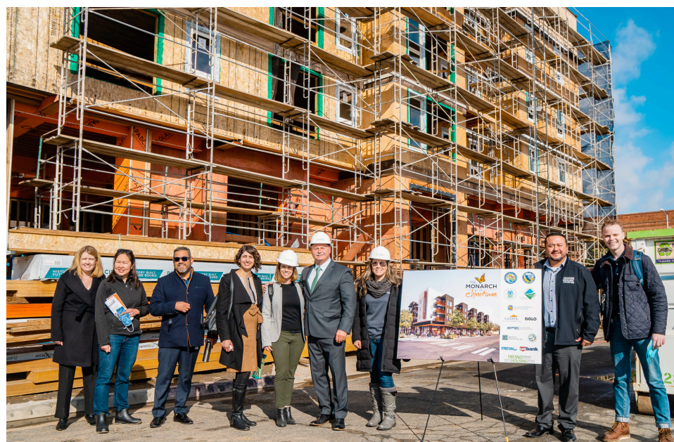
Photos from the Transform Fresno project, which received a $66.5 million TCC grant in Round 1 of the program

"Yóotva (thank you) to the State of California for bringing Tribes into the room and having access to this opportunity. The Karuk Tribe is the second largest Tribe in California and our native communities, like Orleans, are going to be some